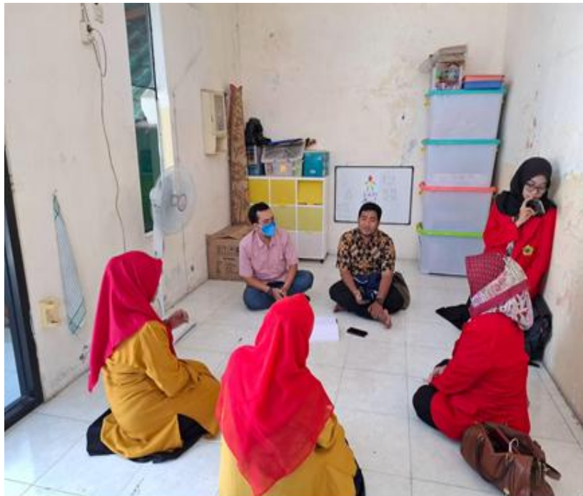
Figure 1. Interview with the Principal

Stage patterns will continue to develop, for example, a child's intellectual development is influenced not only by the school environment but also by the nutritional intake provided within the family. Furthermore, emotional development tends to be innate, so emotional processing in students must be monitored. This means there is a combination, so emotional control is not about prohibiting students when they are in a bad mood, but rather allowing them to express themselves as a natural outlet for human expression. When this happens, students will understand their behavior and its impact on society. The existence of language and social interaction fosters a bond between students and teachers. The use of Indonesian as the unifying language is also supported by the students' regional languages. A personal understanding is fostered during the approach, making it easier for students to understand their own character.